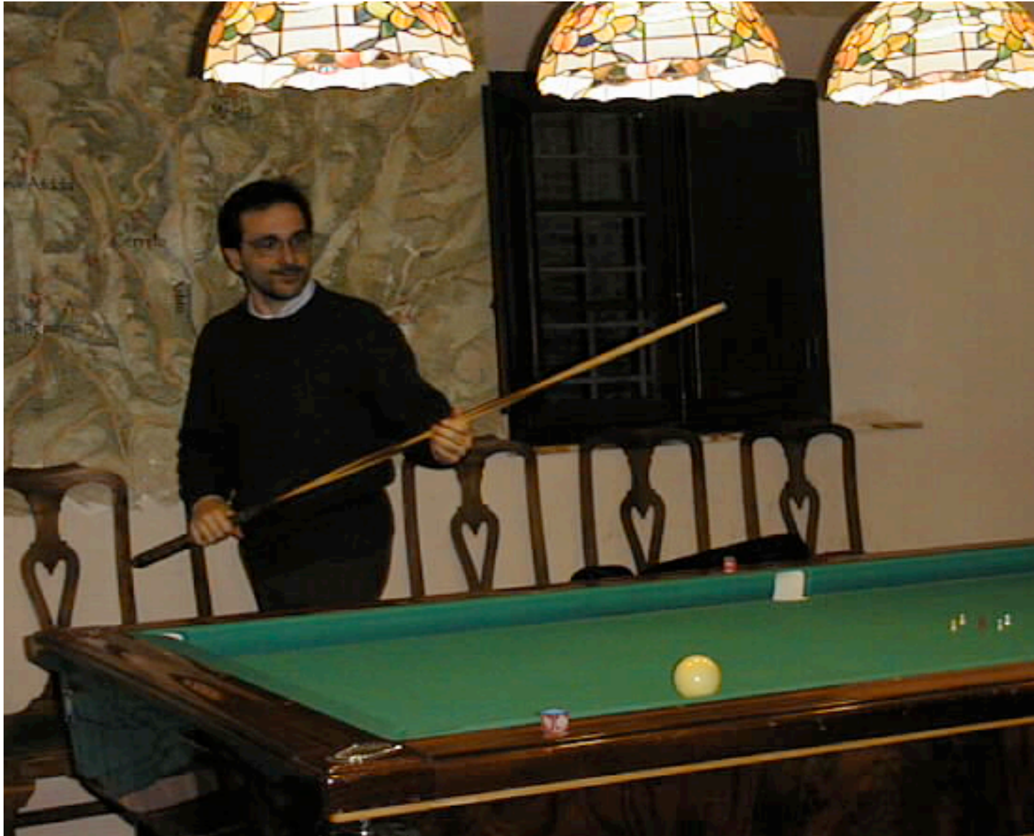
Certosa di Pontignano (2002)